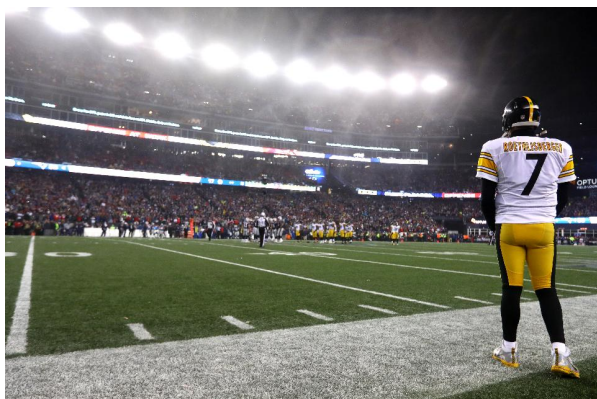
The NFL brand seems to be losing its luster.

In a couple of weeks, more than 100 million people will participate in what has long been one of America's favorite past times: watching the Super Bowl on TV. The Super Bowl has been one of the most-watched TV show for years and 2017 is likely to be no exception. But this national event is starting to show some signs of weakness and this year's game may actually be the latest episode in what seems to be a downward slide for the NFL.